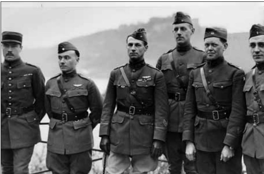
At the battle of St. Mihiel, Billy Mitchell (third from left in this photo taken in Germany, just after World War I) applied his principles of airpower—amass airpower assets and concentrate their use on the enemy right from the start.