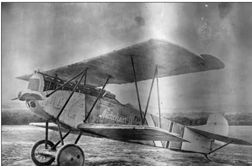
The Germans flew the Fokker D.VII, the most advanced German single-seat fighter to see action in World War I. It had been produced for a fighter competition in early 1918 and went into immediate production.

air and group forces. His planning called for simultaneous strikes from as many as 500 airplanes. The mass formations were to alternate their attacks on each side of the salient in what he called “brigade tactics,” never allowing the enemy to rest.