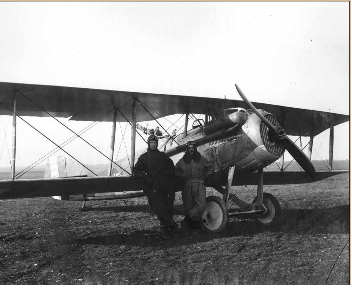
Billy Mitchell (leaning against a Spad at left above) gathered more than 1,400 American and Allied aircraft for the Battle of St. Mihiel in September 1918. At left, among those at his command were 11th Bomb Squadron aircraft, shown in an impressive lineup at Maulan, France, in 1918.

and in the gallant manner in which his equally inexperienced fliers fought it. It was a pattern seen again and again in the decades to come.