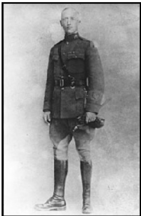
Lt. Col. George S. Patton

On September 12, beginning at 0100 hours, Allied guns unleashed a five-hour artillery barrage across the salient. Immediately following the bombardment, the Doughboys of the 42nd, supported by Patton's 327th Tank Battalion, started toward their objectives.