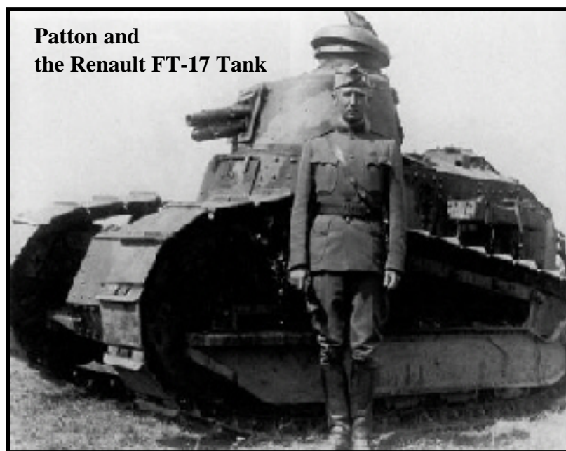
Patton and the Renault FT-17 Tank